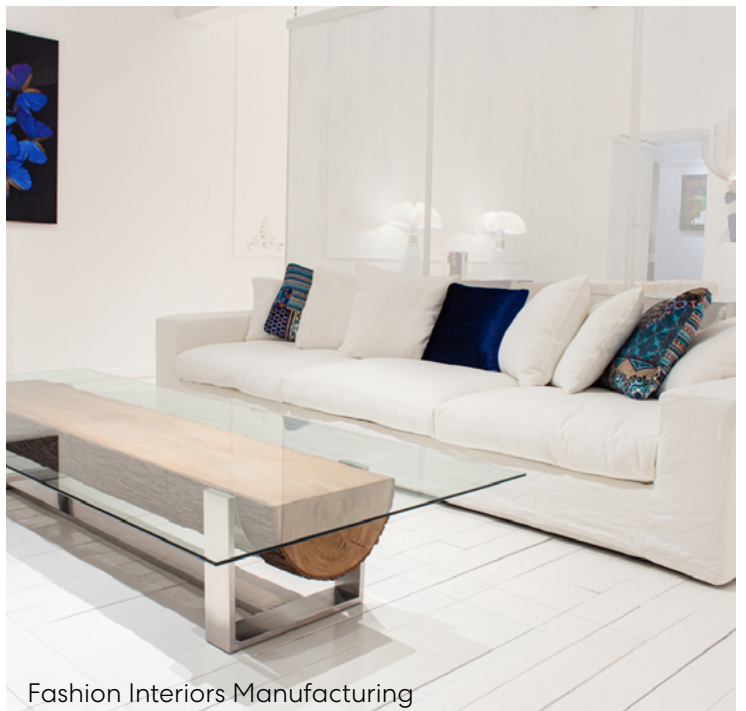
Fashion Interiors Manufacturing

Each company featured in SALON is carefully vetted and hand-selected. We scour the planet to find the newest and finest home furnishings companies, providing buyers with new resources and the latest products each market.